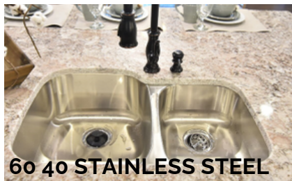
60 40 STAINLESS STEEL