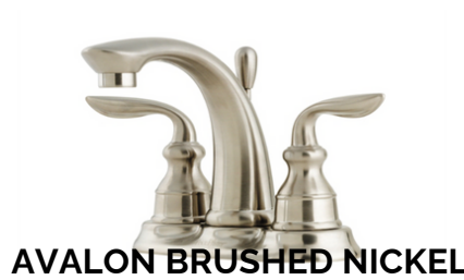
AVALON BRUSHED NICKEL