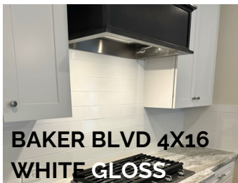
BAKER BLVD 4X16 WHITE GLOSS