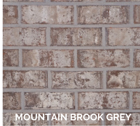
MOUNTAIN BROOK GREY