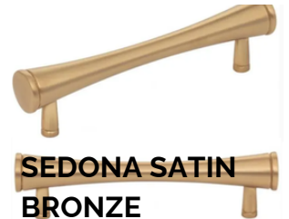
SEDONA SATIN BRONZE