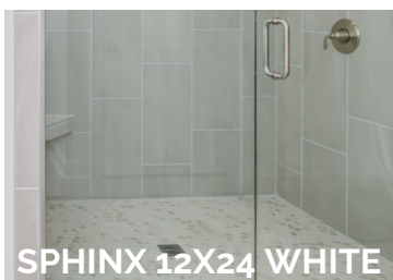
SPHINX 12X24 WHITE