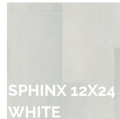
SPHINX 12X24 WHITE